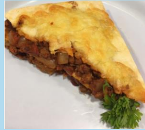
Beef Tortilla Stack