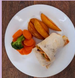
Mexican Fajitas with Rice