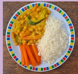
Sweet Potato & Lentil Curry