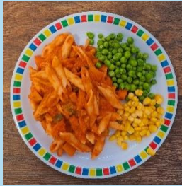
Tomato and Vegetable Pasta