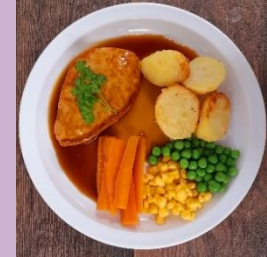
Quorn Fillet with Roast Potatoes