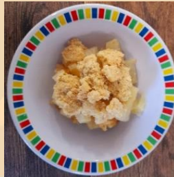
Apple and Blackberry Crumble with Custard