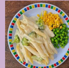
NEW Cheese and Broccoli Pasta with Garlic Bread