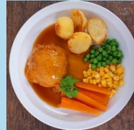
Roast Turkey with Roast Potatoes